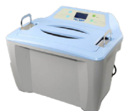
Scooba-S Ultrasonic Cleaner Without Heat 4.8l