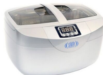
Digital Ultrasonic Cleaner