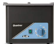
Economy Ultrasonic Cleaner, 110 V