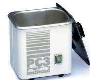
Quantrex Ultrasonic Cleaning System