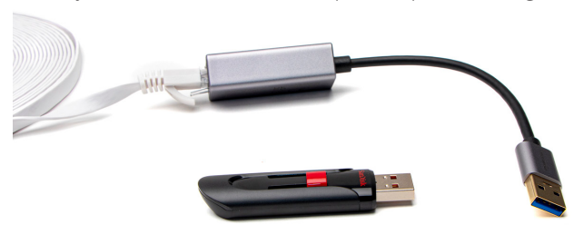
Fig. 1—The EVA-AC-03-01 kit includes the cable, the adapter, and the thumbdrive with software.

1. Use an EVOM™ Auto Wired Connection Kit (WPI# EVA-AC-03-01) to configure the ethernet access for an EVOM™ Auto System with 24 and 96 well plate capabilities (Fig. 1).