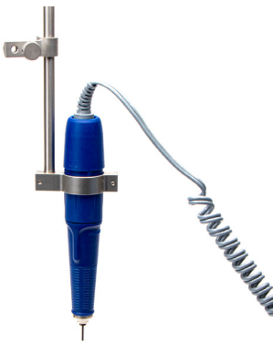
Fig. 5—WPI P40 Drill mounted in a 505247 which can be mounted on a stereotaxic frame.