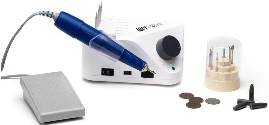
Fig. 1—WPI P40 Microdrill

NOTES and TIPS contain helpful information.