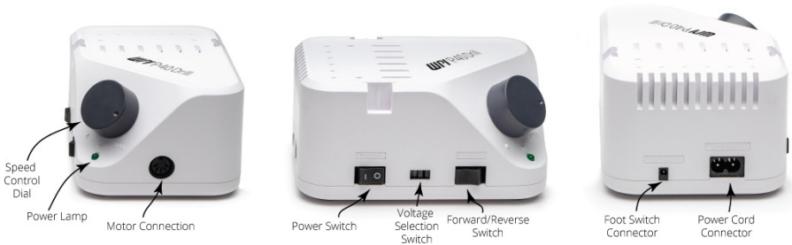
Fig. 3—The WPI P40 Drill components are labeled.

Speed Control Dial – Variable speed control dial lets you choose from 0-40,000 RPM.