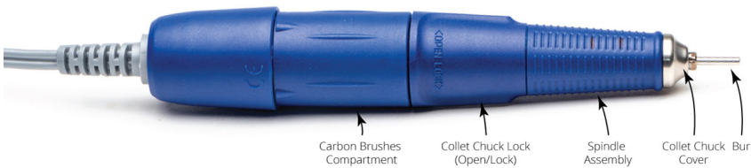
Fig. 4—Microdrill features are labeled.

Power Cord – Plug cord into a standard wall outlet (mains).