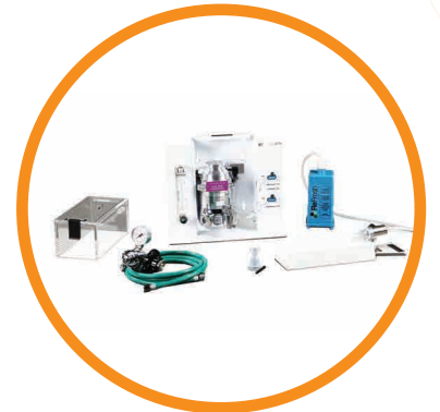
EZ-B800 Anesthesia System