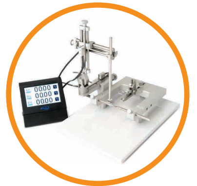
505351 Rat Digital Frame