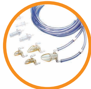
OC-ALLFM-KIT Face Mask Kit