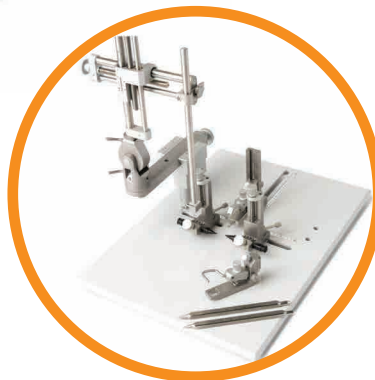
505200 Standard Mouse & Rat Frame