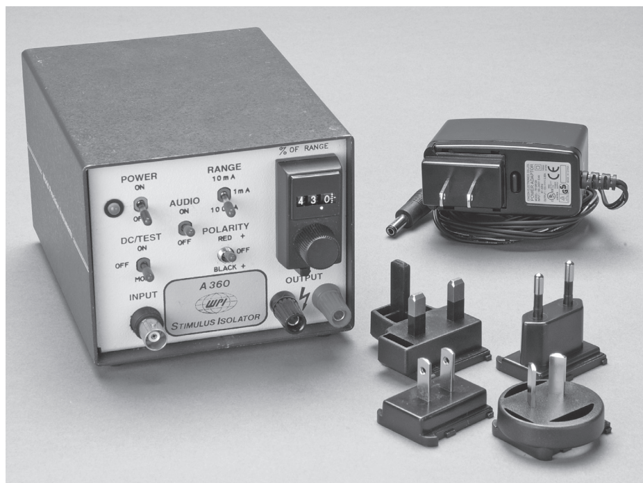
AC recharging power supply and set of international connectors included with each A360LA.