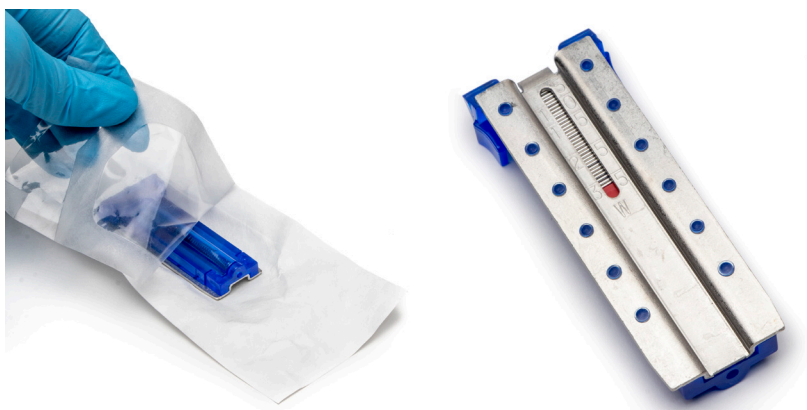
Fig. 4—Open the sterile cassette and insert it into the stapler until you hear a click.