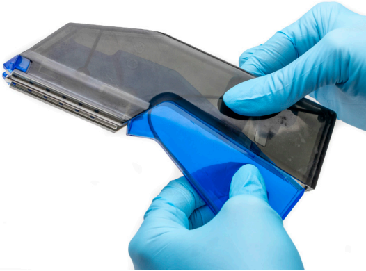
Fig. 5—Pinch the blue handle and latch it back into place to secure the staple cassette.