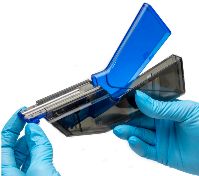
Fig. 3—Slide the staple cassette out of the stapler.