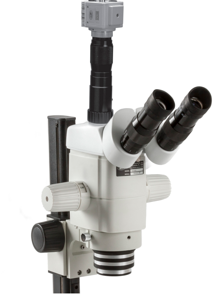
Fig. 1—The PZMIV binocular microscope is shown on its standard track stand.

NOTES and TIPS contain helpful information.