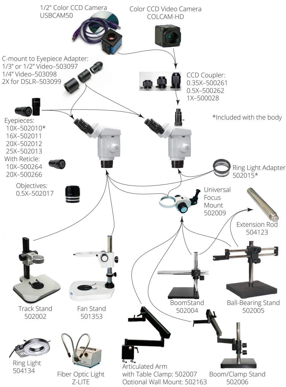
Fig. 3—This diagram shows many of the options available for the PZMIV.