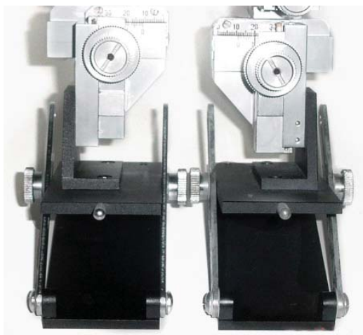
Fig. 2 — (Right) M3 bracket is reversed for the KITE-L (left). The KITE-R (right) is mounted on an M-3 base without modifications.