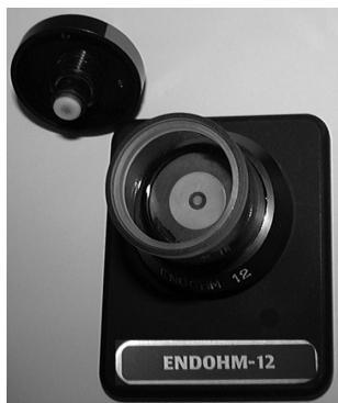
Fig. 4 and Fig. 5 show an EndOhm that has been re-chlorided.

Once a week, or as needed, the electrode can be re-chloridized. Immerse the tips of the electrode in common a 5% solution of sodium hypochlorite (bleach) for 10 minutes or until a black-purple layer is formed. Do not use a solution stronger than 3–6% sodium hypochlorite. Rinse well in distilled water and flush with the growth buffer prior to use. Test the electrode with a CaliCell-12 (WPI #CALICELL-12).