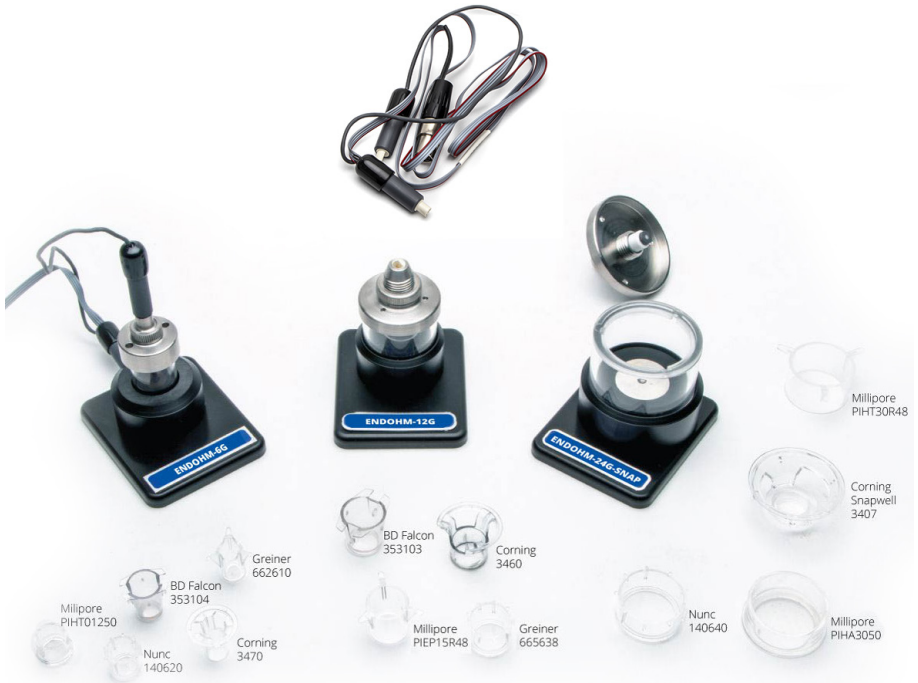
Fig. 1—Endohm-6G, Endohm-12G and Endohm-24G

NOTES and TIPS contain helpful information.