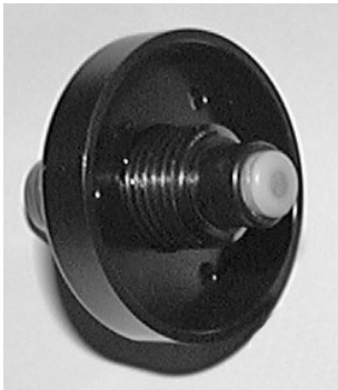
Fig. 6—(Left) A clean EndOhm surface with no spots or irregularities Fig. 7—(Right) Notice the center tip and the small ring on the top section. These may require the use of a cotton swab to clean.

Rarely you may need to resurface the electrode. Dry the electrodes and lightly “sand” or buff just the tip of the electrode with a very fine grain Emory paper (600 grit or more) or used an “ink” eraser to lightly buff the electrode ends. Remove only a very thin surface layer of the pellet. After sanding the pellet, re-chloride the tips using the instructions above.