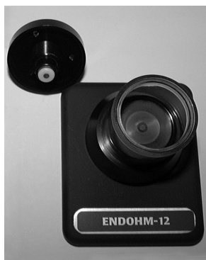
Fig. 4—(Left) ENDOHM-12G shown that has not been chlorided enough