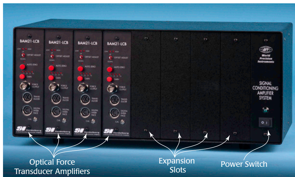
Fig. 2 The front panel of a 95350 (chassis configured for an SI-MB4) has four SI-BAM21-LCB cards.

Optical Transducer Amplifier —The SI-BAM21-LCB powers the force transducer and converts the output of the transducer to an amplified analog voltage that is proportional to the force applied to the transducer. The output signal can be multiplied by a factor of 1, 2, 5 or 10 to provide better resolution for a minimal change in applied force.