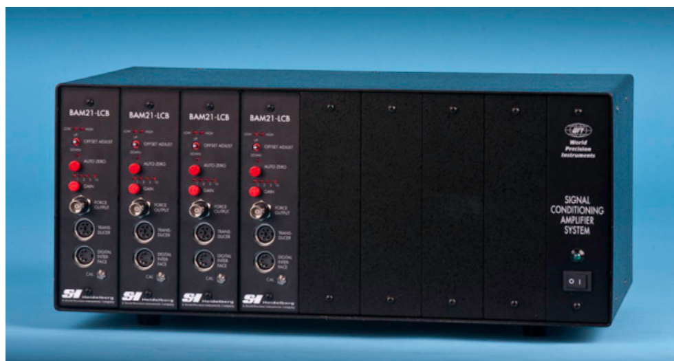
Fig. 1 Signal Conditioning Amplifier System configured for the SI-MB4 Muscle Bath

NOTES and TIPS contain helpful information.