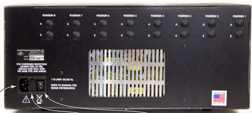
Power Connector Fuse Housing Master Power Switch

Fig. 3 The back panel of the SI-BMFA chassis has a master power switch that is usually left on.