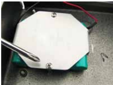
Fig. 2 –Battery pack mounted to bottom chassis plate of EVOM 2