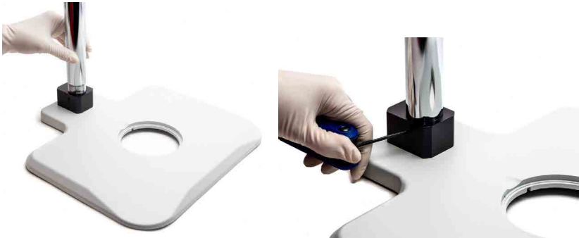
Fig. 3—(Left) Set the base upright and screw the vertical post in place.