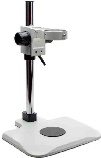
Fig. 1—The 503102 Post Stand is shown with the 54947 focus mount.

NOTES and TIPS contain helpful information.