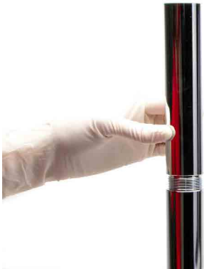
Fig. 5—Screw the post extension on the top of the vertical post.