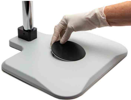
Fig. 11—Position the front edge of the reversible plate first and then snap the back edge into place.