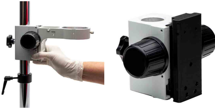
Fig. 8—(Left) Slide the focus mount into place. Fig. 9—(Right) The 505609 slides over the post the same way the 504947 focus mount does. It is used with the 505608 Post Stand for the Enhanced Reality Macrocope.