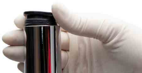
Fig. 10—Screw the vertical post top cap into place.