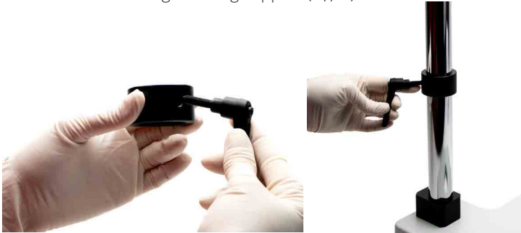
Fig. 6—(Left) Screw the clutch handle into the threaded hole in the side of the guard ring. Fig. 7—(Right) Slide the guard ring over the top of the vertical post.