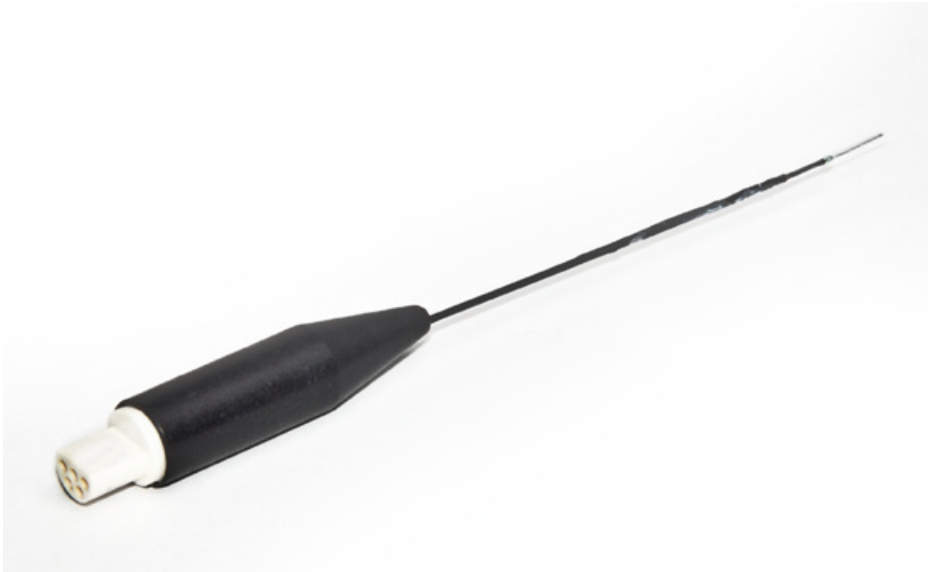
Fig. 1—The ISO-H2S-100 sensor is a platinum wire electrode that functions similar to WPI's ISO-H2S-2 sensor.

NOTES and TIPS contain helpful information.